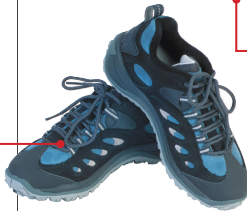
Actual Representative Size